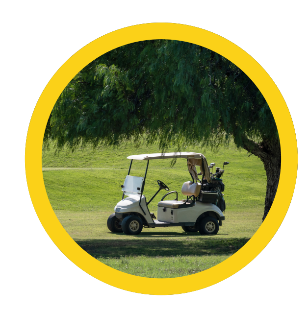
Title Sponsor $3,000